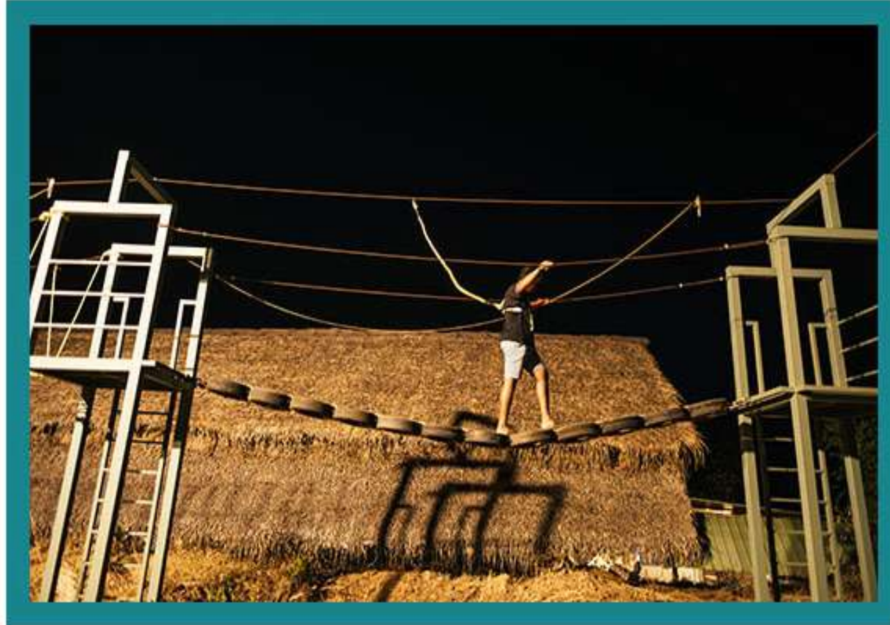
Adventure Rope Activity